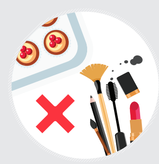
Remove product samples and testers