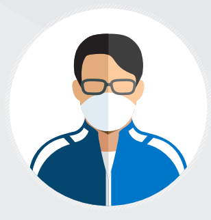
Wear mask at all times when not eating or drinking