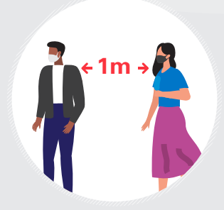
Keep at least 1m away from other people