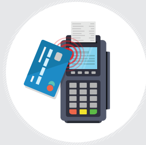
Use contactless payment whenever possible