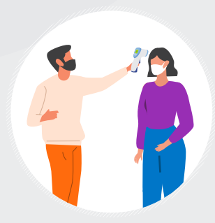
Allow staff to take your temperature